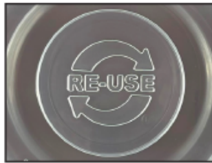
Snap-tight, push-button close